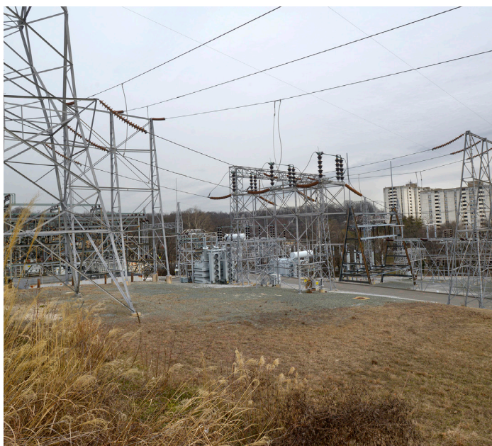
Current Takoma Substation

We welcome the opportunity to work with residents and business owners to gather public feedback and input. We are committed to keeping customers informed every step of the way through the project webpage, community meetings, and social media. To find a community meeting in your neighborhood, visit www.pepco.com/CapitalGrid .