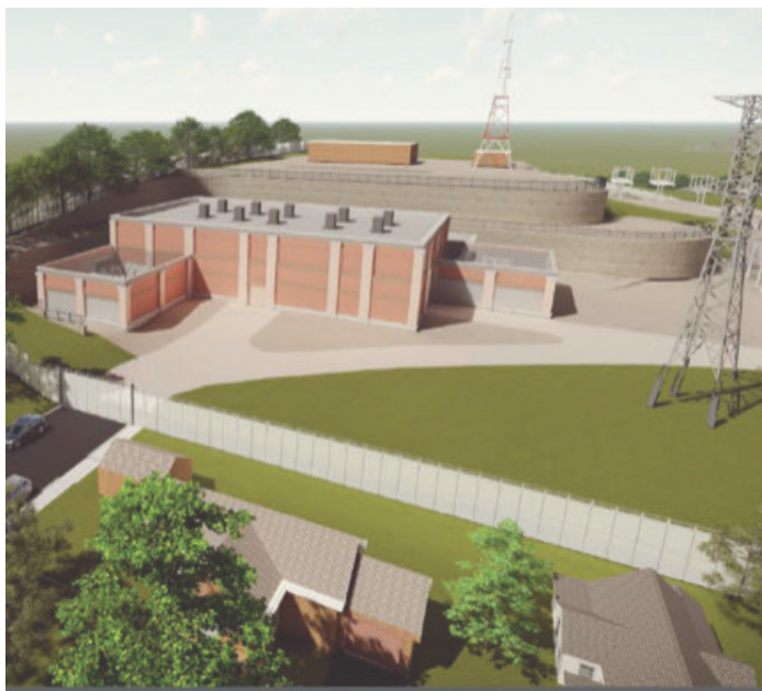
Takoma Substation Rendering